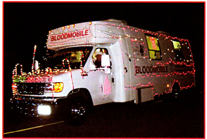
Our newest bloodmobile in the annual Trucker's parade this last Christmas.