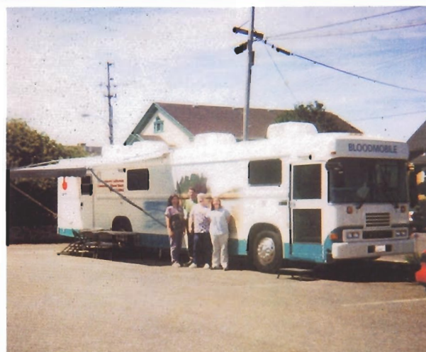
The new Blood Mobile